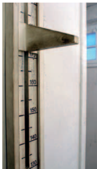
Yardstick in the reconstructed facility for execution by shooting