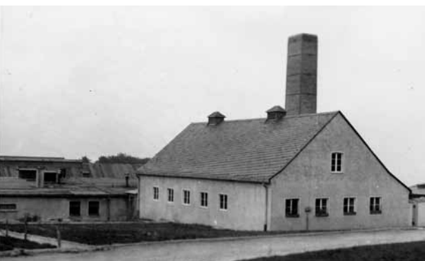
An early view of the crematorium (before the inner courtyard was fenced in). The dissection room of the pathology department was located in the annex on the left.