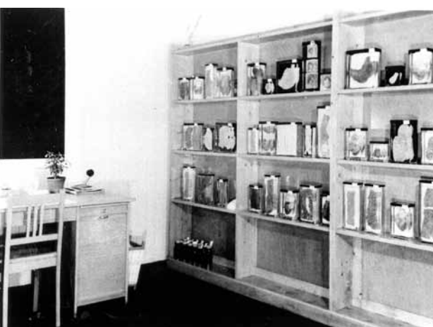
Pathology department office with specimens. The photo is in an album Camp Commander Hermann Pister had compiled in late 1943. Photo: Buchenwald Concentration Camp Records Office, 1942/43 / Musée de la Résistance et de la Déportation, Besançon

Photo: Buchenwald Concentration Camp Records Office, 1942/43 / Musée de la Résistance et de la Déportation, Besançon