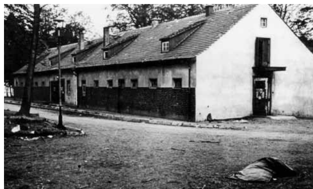
The stable in which the facility for execution by shooting was located, April 1945

The flat-roofed crematorium annex was originally a latrine. In the 1960s, the so-called “facility for shooting in the back of the neck” was reconstructed by a former inmate and installed here. The actual site of the executions carried out with this facility was a former stone stable outside the camp downhill from the SS caserns. There the SS systematically murdered Soviet prisoners of war by shooting them in the back of the neck. The crime was carried out in compliance with the Commissar Order (Kommissarbefehl) issued by the supreme commander of the Wehrmacht. SS security service detachments rounded up officers, political commissars, intellectuals and Jews in the prisoner-of-war camps, and special SS detachments – in Buchenwald Detachment 99 – carried out the executions in the respective concentration camp. The shooting facility consisted of a series of rooms designed to make the unsuspecting POWs think it was a station for medical examinations. The interior of the stable had been altered in such a way that the executioner and his victim did not encounter one another. The prisoner was ordered to go and stand in front of a yardstick of the type mounted on the wall in every doctor's office. This yardstick was constructed with a slit, through which an SS man standing in a small adjacent chamber then shot the victim in the back of the neck. The shots were drowned out with loud marching music. The transport of the corpses to the crematorium was carried out in zinc-lined