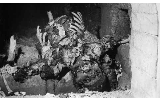
Human remains in one of the crematory ovens, 16 April 1945