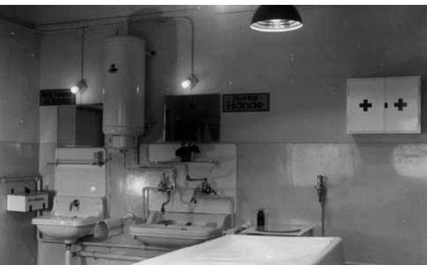
Dissection room of the pathology department in the crematorium annex. The photo is in an album Camp Commander Hermann Pister had compiled in late 1943.