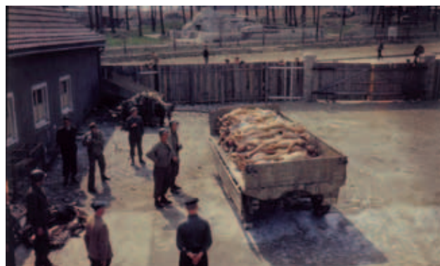
American soldiers in front of a trailer loaded with corpses in the inner courtyard of the crematorium, 18 April 1945

Ernst Thälmann, the last chairman of the German Communist party in the Weimar Republic, was murdered in the back courtyard of the crematorium in August 1944. It was for this reason that, unlike the crematoria in other concentration camp memorials in Germany (Bergen-Belsen, Neuengamme, Ellrich) – where they disappeared as unwelcome scenes of crime – the facility in Buchenwald was left standing in the GDR after 1950 as place of commemoration. The commemorative plaque dedicated to Thälmann in 1954 – the first such plaque to be dedicated in the memorial – is still on view in the back courtyard. Today the former camp crematorium is a central site for the mourning and commemoration of all who died and were murdered. Since there are no graves for the 56,000 victims of Buchenwald, the crematorium now serves as their funerary monument. Here their descendants and other visitors lay wreaths, flowers and stones in their honour. At the same time, the cremation ovens continue to be the most visible and most indisputable evidence of the industrial and eliminatory character of the National Socialist crimes.