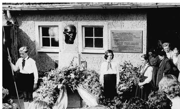
"Thälmann Pioneers" in the back courtyard of the crematorium on the anniversary of the death of Ernst Thälmann, 18 August 1957