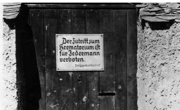
Door to the crematorium courtyard. The crematorium was surrounded by a wooden palisade, April 1945