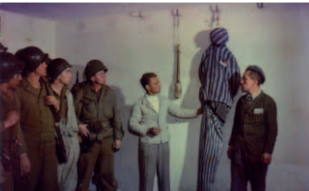
Camp survivors explaining the strangling method in the execution cellar of the crematorium, 18 April 1945