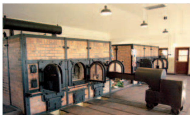
The crematory ovens in the Buchenwald crematorium